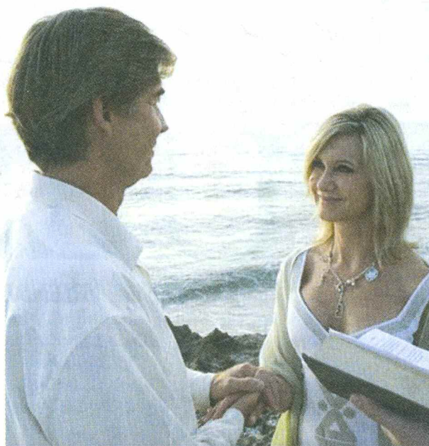
Olivia Newton-John Easterling Florida wedding

When Olivia and her husband are not busy saving people and the planet, Olivia tells me she is excited about an